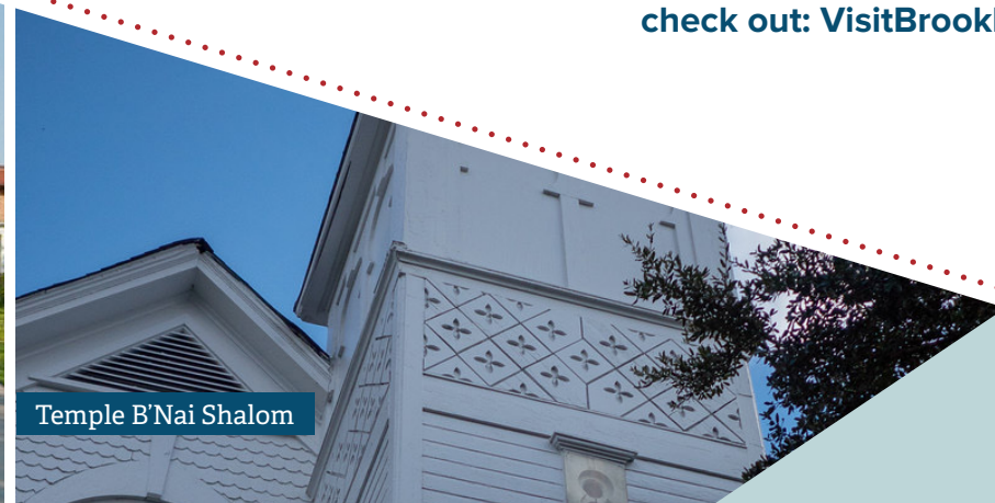
Temple B'Nai Shalom