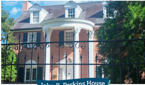
John B. Perkins House