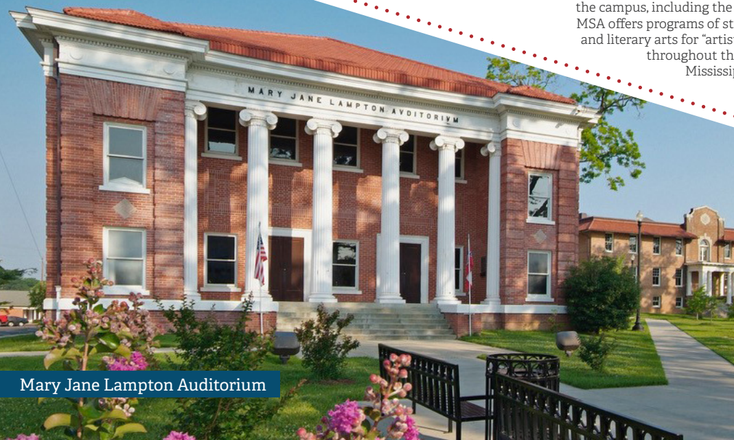
Mary Jane Lampton Auditorium